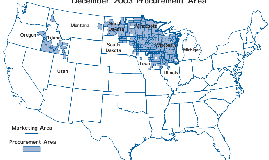
Upper Midwest Marketing Area and December 2003 Procurement Area

The map below graphically shows the states and counties from which producer milk was received in December 2003.